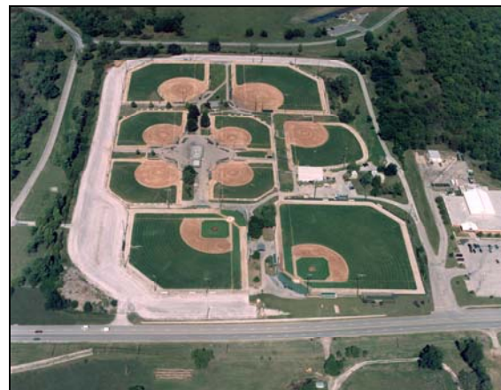
3&2's East Complex

We want to keep membership in the Diamond Club simple, powerful, and interesting. We have organized a luncheon format to meet twice a year with the goal of celebrating 3&2's past, present, and future over a great lunch. Maybe even more than a hot dog! You'll hear local leaders from the world of sports, business, and politics share their own 3&2 tie that binds us and the importance of youth sports programs overall.