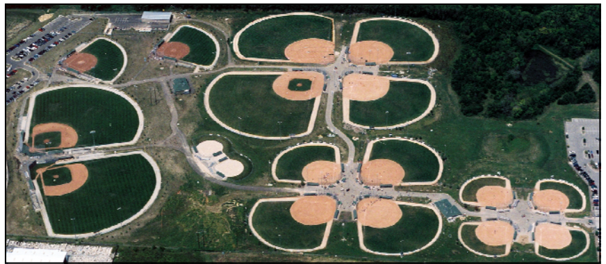
3&2's West Complex

The 3&2 Diamond Club is a like-minded group interested in the advancement of 3&2 and the preservation of its mission to provide youth of this community with a positive environment, promoting sportsmanship, instruction, teamwork and the enjoyment of baseball. The primary focus of the Diamond Club is specific, measurable, and game changing for the program and the people it serves today and tomorrow—100% of contributions of any kind generated by this club will go toward the 3&2 Baseball Family Scholarship Program and facility enhancements that add direct value to the park, such as batting cages and field lights.